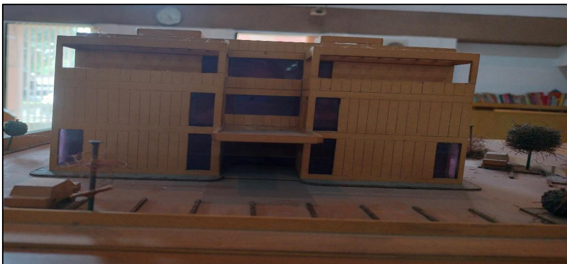
Fig. 2- LIBRARY DESIGN

The library is spacious, three-storied and provides wide range of collection and services to the users. It has: