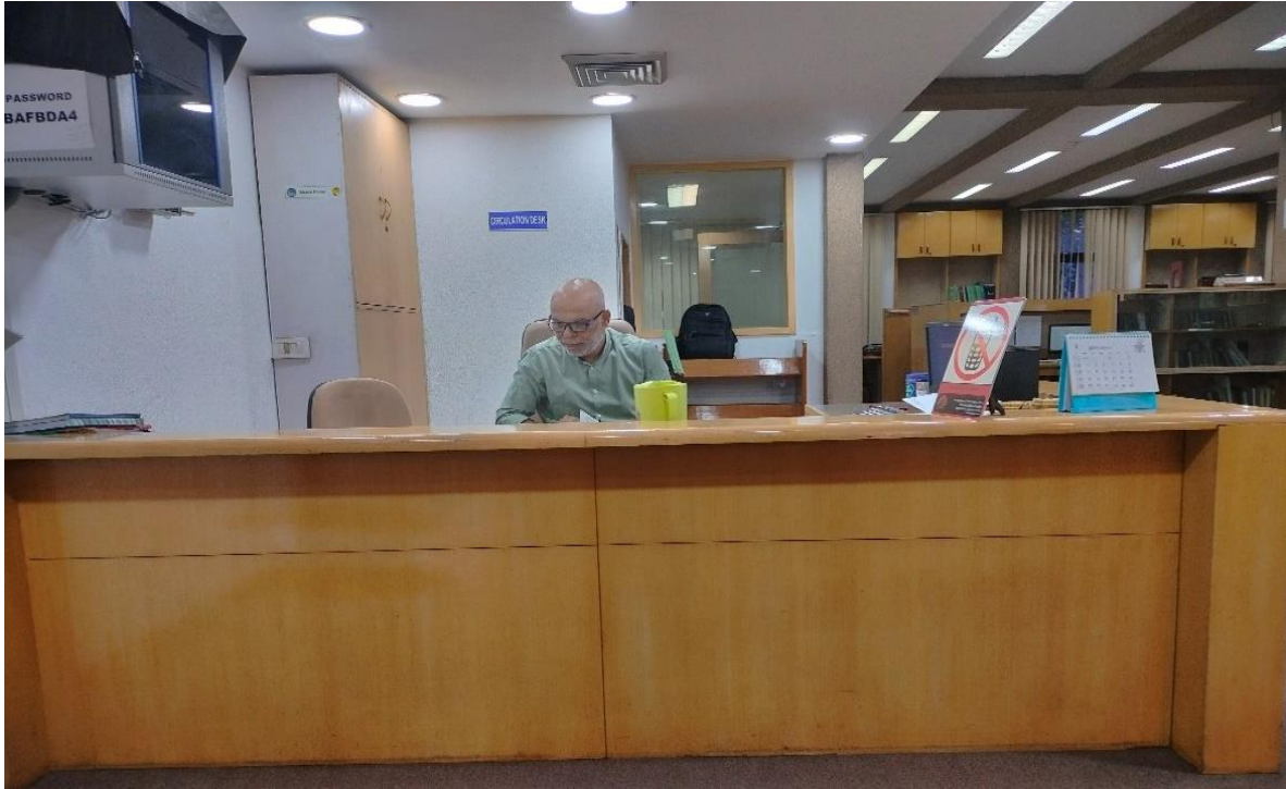
Fig. 3- CIRCULATION SECTION