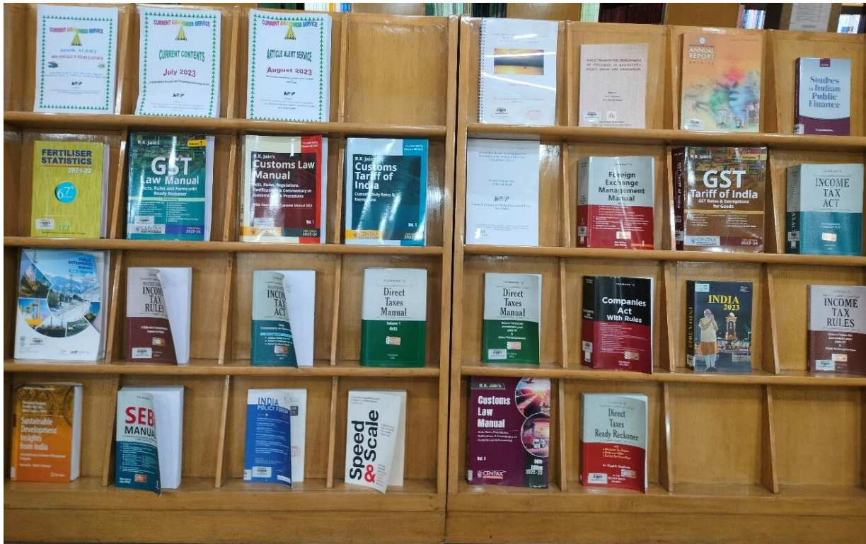
Fig. 7- NEW ARRIVALS