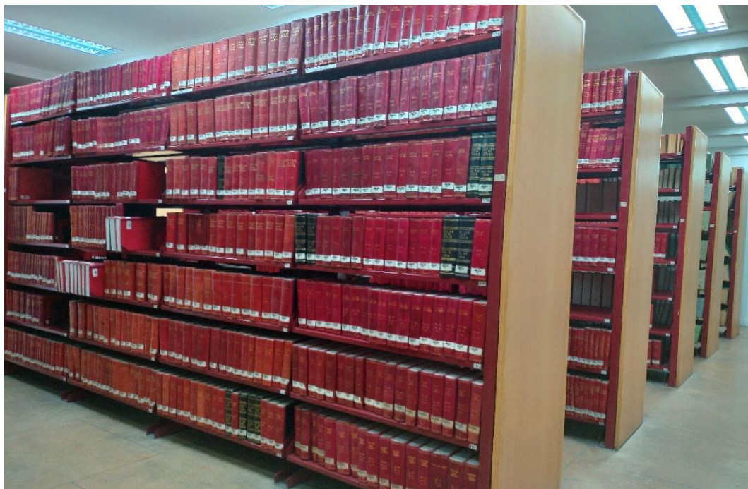
Fig. 12- BOUNDED JOURNALS