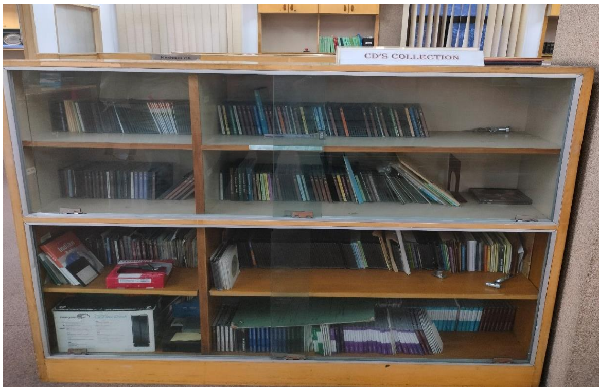
Fig. 8- CDs COLLECTION