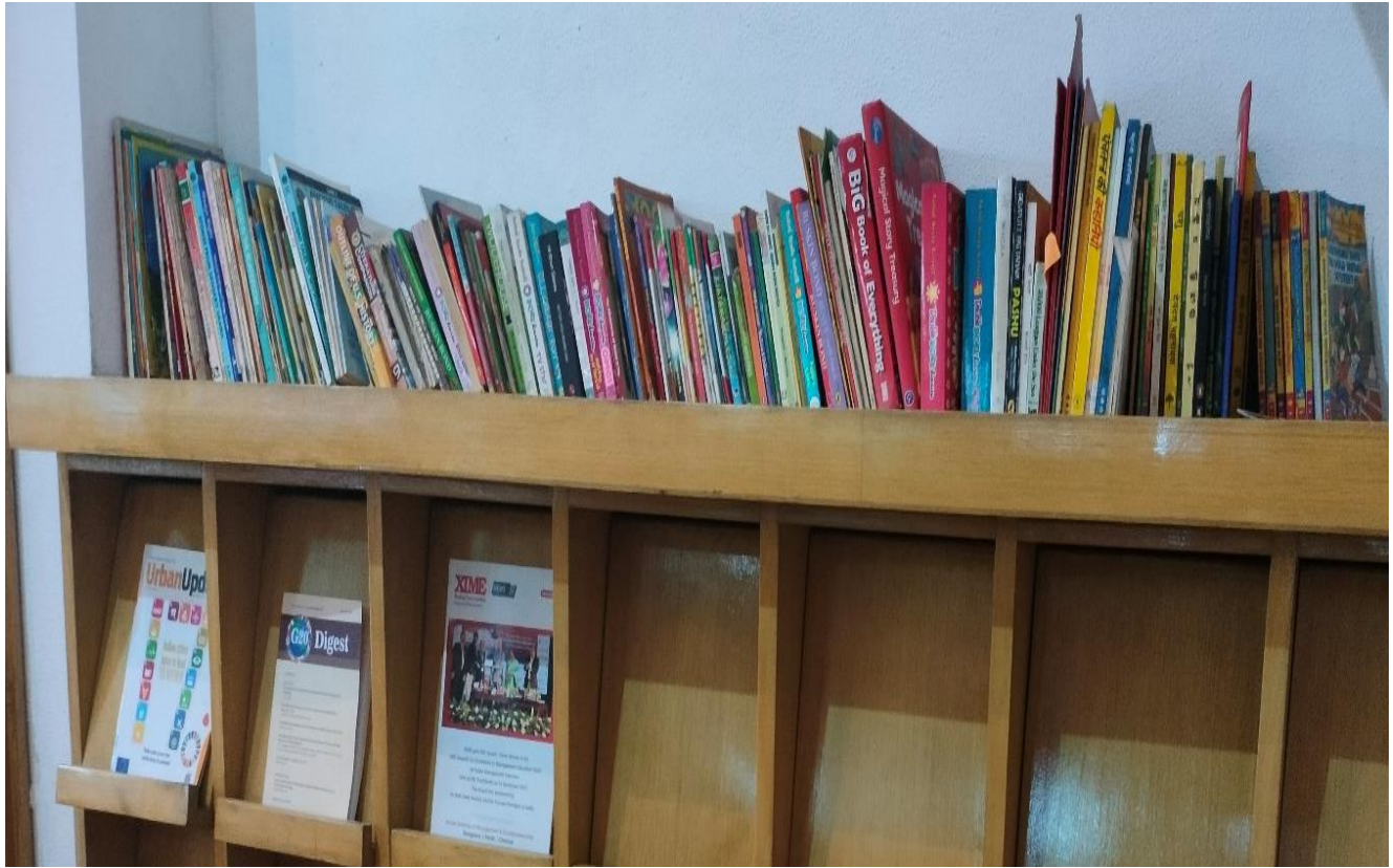
Fig. 13- STORY BOOKS