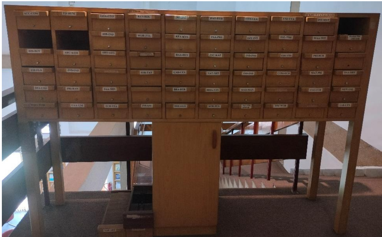
Fig. 11- CATALOGUE CARDS