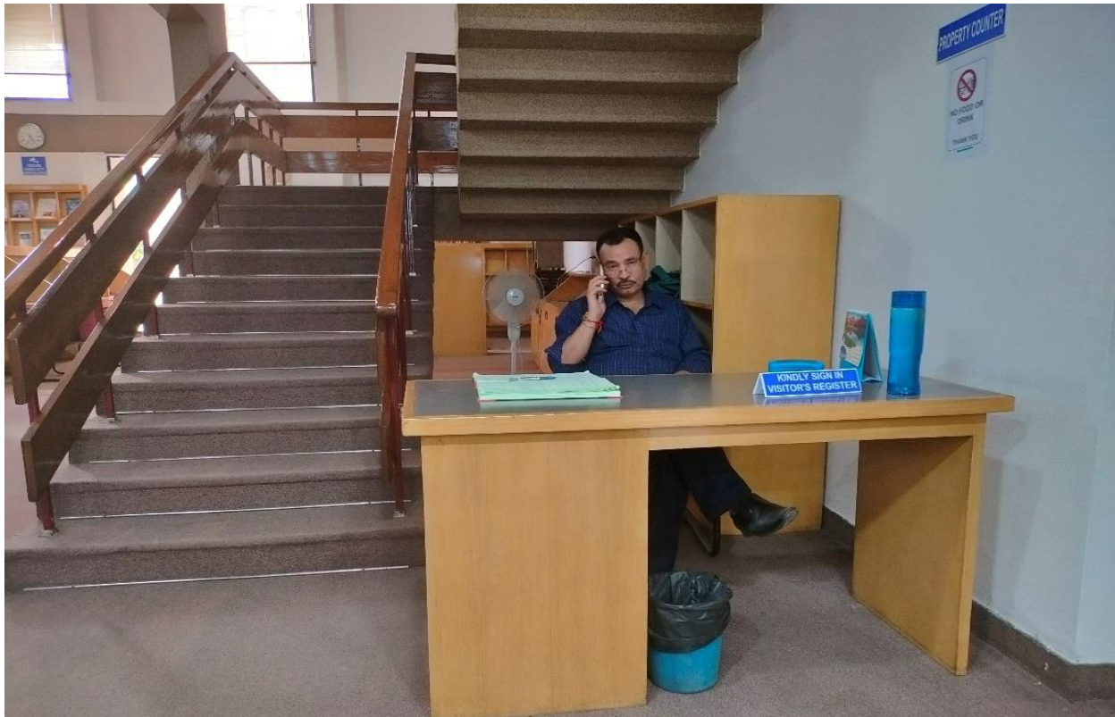
Fig. 4-PROPERTY COUNTER