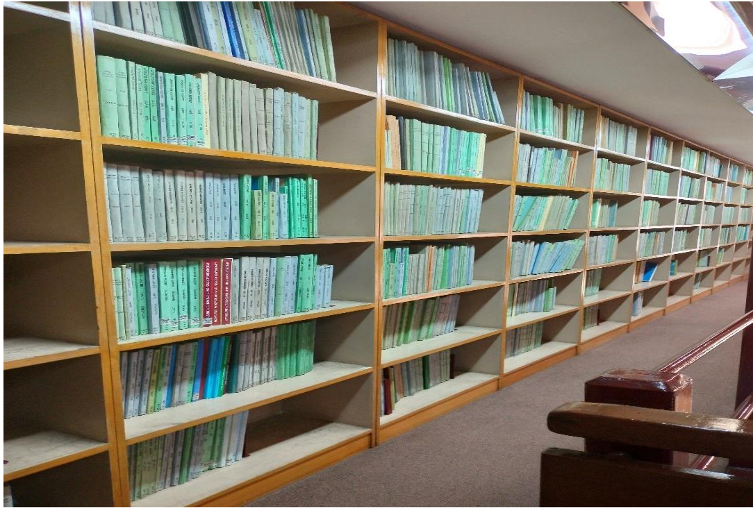
Fig. 9- BUDGET & CENSUS SECTION