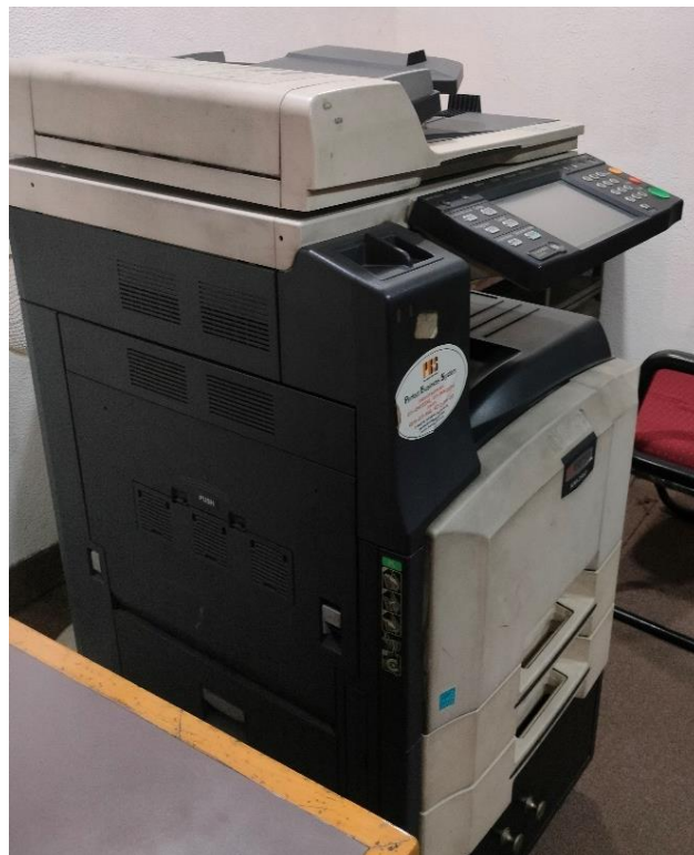
Fig. 10- REPROGRAPGY SECTION