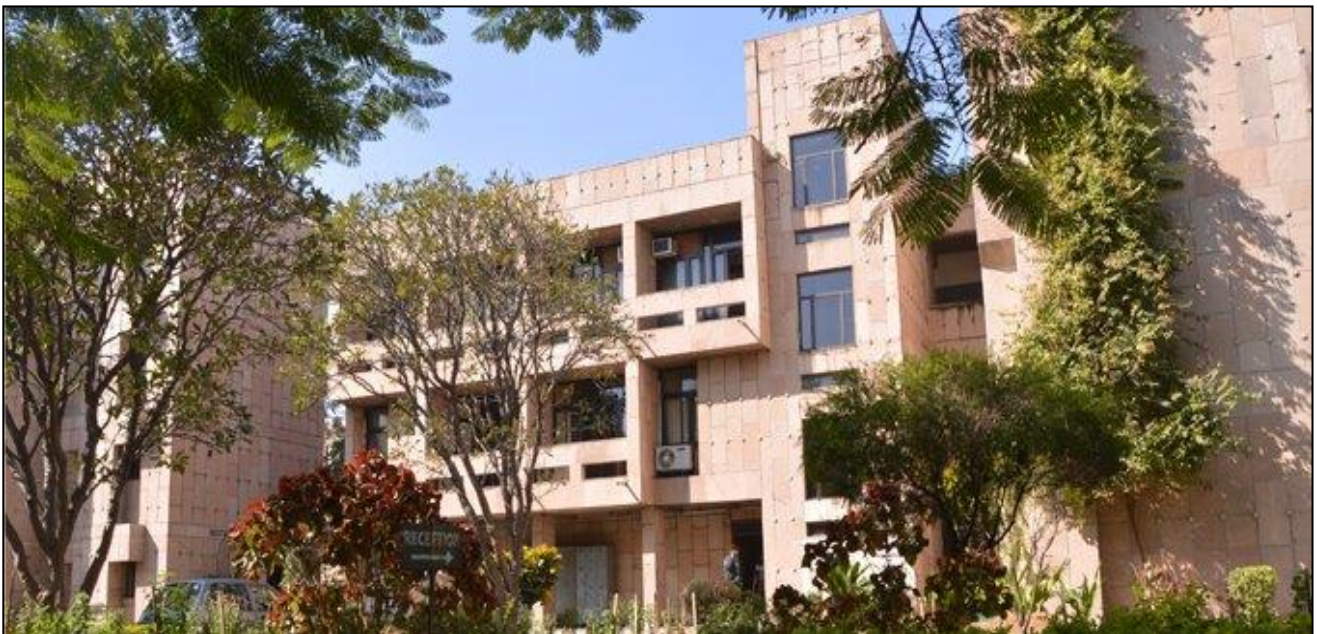
Fig. 1- NIPFP (Academic Block)

In its 45 years of existence, the institute has emerged as a premier think tank in India, and has made significant contribution to policy reforms at all levels of the government. It has maintained close functional links with the Central and State governments all along, and has built up linkages with other teaching and research institutions both in India and abroad. Although the institute receives an annual grant from the Ministry of Finance, Government of India, and various State governments, it maintains an independent non-government character in its pursuit of research and policy.