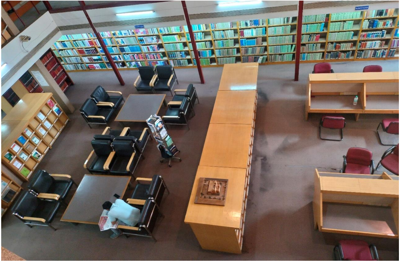
Fig. 5- MAIN READING HALL